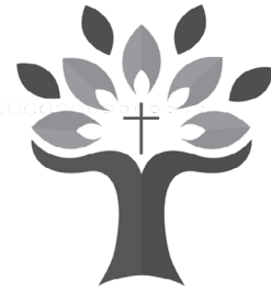
Lutheran Planned Generosity of South Dakota

2022 will be remembered as a year of challenges--drought, global conflict, stock market corrections, and hard-hitting inflation. Plenty of reasons for anxiety and pulling back, saving and waiting. But also opportunities for genuine reflection about generosity . What does it look like? Is this fruit of the Spirit reflected in my life? How much is ENOUGH (for me)?