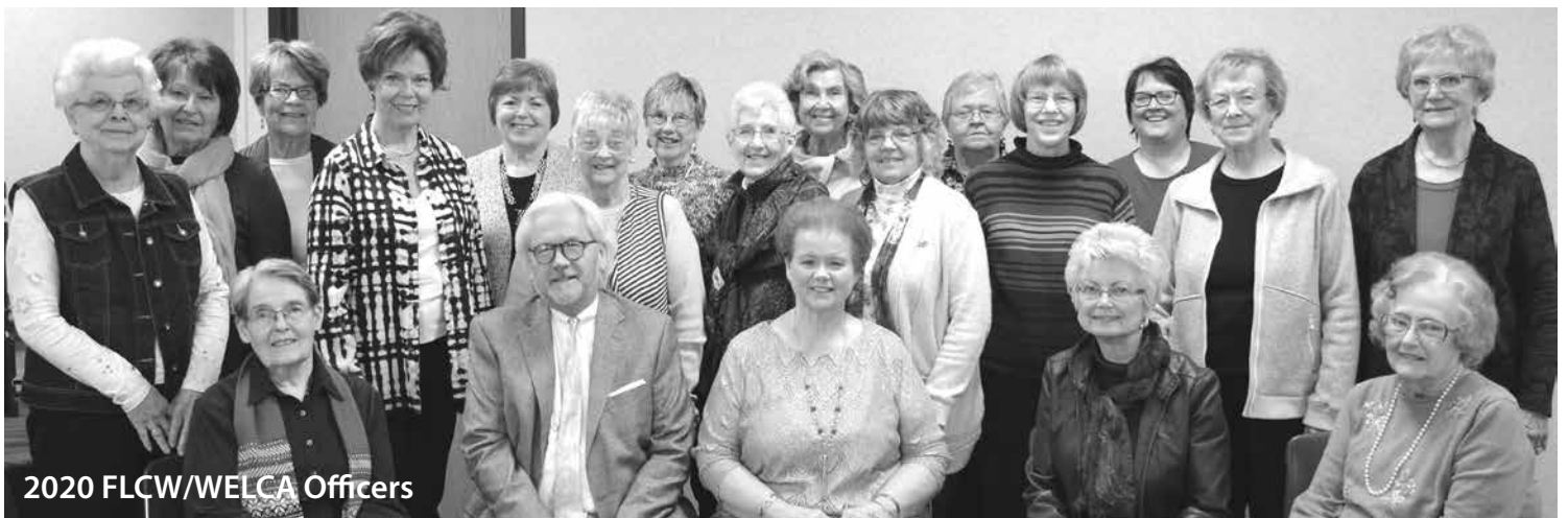
2020 FLCW/WELCA Officers

Please see page 20 for the 2020 Bazaar Fund disbursements as well as offerings that were disbursed from 2019 Bazaar funds.