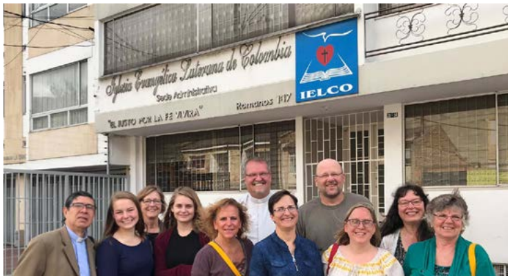
Colombia summer mission participants