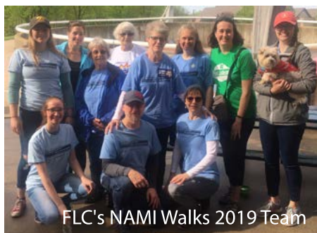
FLC's NAMI Walks 2019 Team