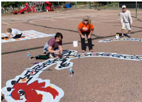
FLC volunteers paint games on the playground at Lowell