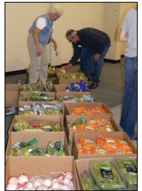
Volunteers prepare fresh produce for distribution. First Lutheran sponsored the Sept. 9 distribution of the Food to You Mobile Food Pantry.

To learn more about the Food to You Mobile Food Pantry and their distribution dates, check out their website at: www.mobilefoodpantry.org .