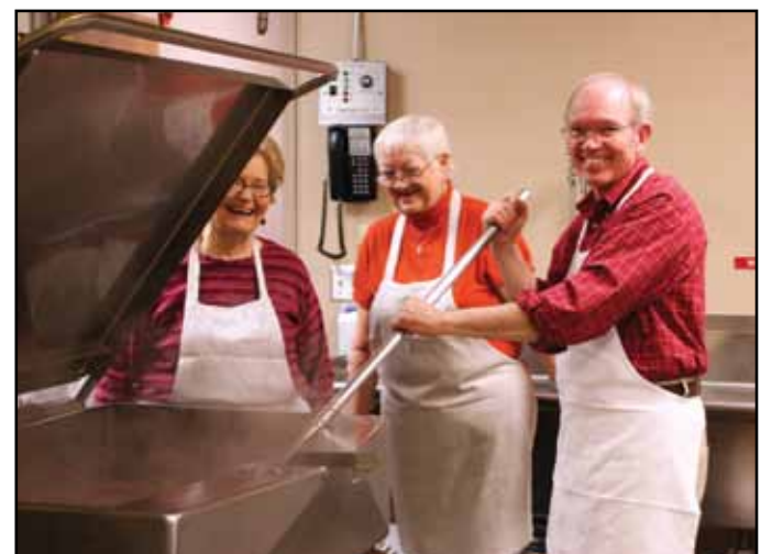
Volunteers from First Lutheran cook at The Banquet.

"Faith is God's work in us that changes us and gives new birth from God (John 1:13). It kills the Old Adam and makes us completely different people. It changes our hearts, our