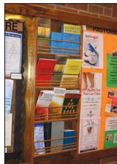
Check out the new brochure rack in the atrium for information on addiction.

Jesus says in John 14:1-3, “Do not let your hearts be troubled. Trust in God; trust also in me. In my Father’s house are many rooms; if it were not so, I would have told you. I am going