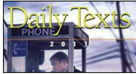
The 2011 Daily Texts is available in the church library.

If you would like to order a copy of the 2012 devotional for personal use, stop by the Information Desk for more information.