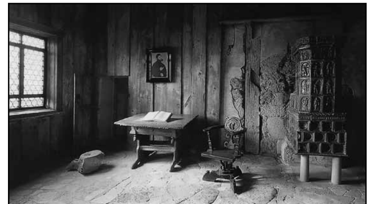
Martin Luther’s desk. Make your desk a place of sacrifice (Romans 12:1–2). Commit yourself to your studies. ... Allow time for your desk to be a place of creativity. ... And finally, let your desk be a place of worship.

Make your desk a place of sacrifice (Romans 12:1–2). Commit yourself to your studies. With spirited midnight oil, burn your eyes out, saying “Yes” to that calling, giving priority to growing in faith and knowledge—through regular Bible study, serious theological reflection, through studying the arts and sciences, great literature, and then falling out of your chair in Christian service. Yet also learn to say “No”—when there are so many sirens of today’s mass media—of texting and tweeting, twitter and bleeping—that seek to dull and dim-wit you into spiritual complacency and intellectual mediocrity, of biblical illiteracy and moral indecency. Don’t waste your time with laissez faire indifference—whether out of a conservative smugness or liberal self-righteousness. Live each day to its fullest (Psalm 90:12). And ... “Always be prepared to make a defense to any one