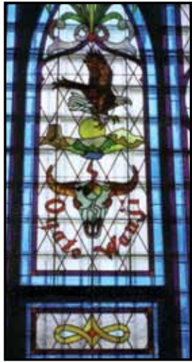
A stained glass window in the sanctuary at St. Dysmas.