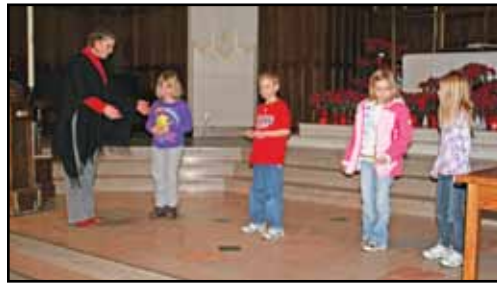
Second-graders prepare for their Confession and Forgiveness Milestone in the sanctuary.