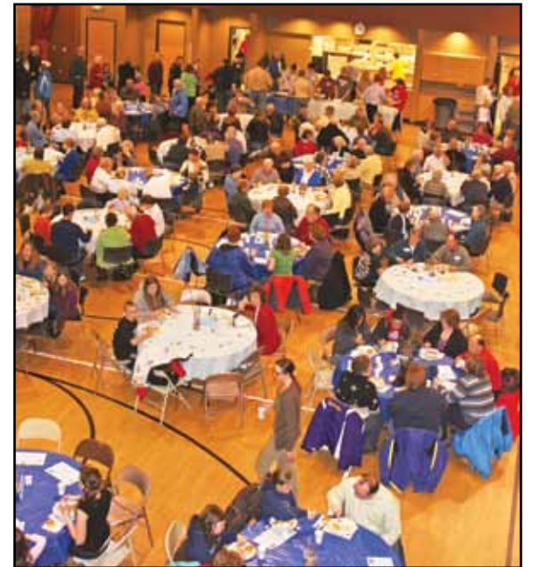
The family of FLC fills Reformation Hall during the Wednesday Night Meal. ◀ Volunteers dish up turkey and mashed potatoes.